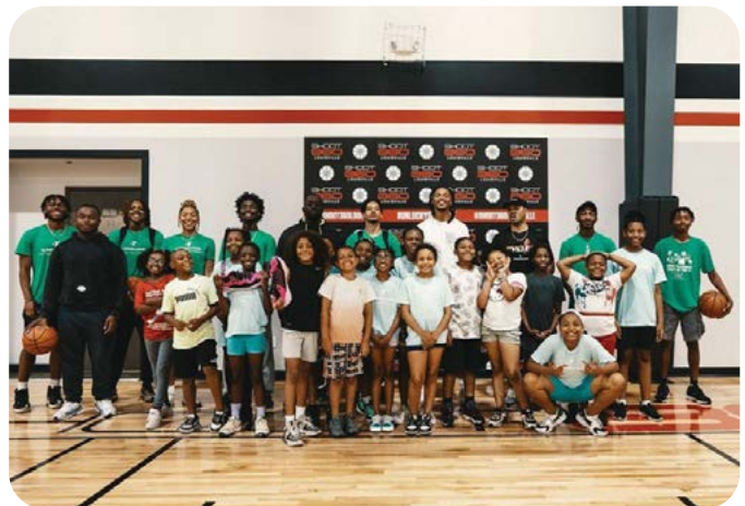
NBA champion and former UofL star Damion Lee spent time giving back to the community by teaching young campers at a local basketball camp in July, 2024.